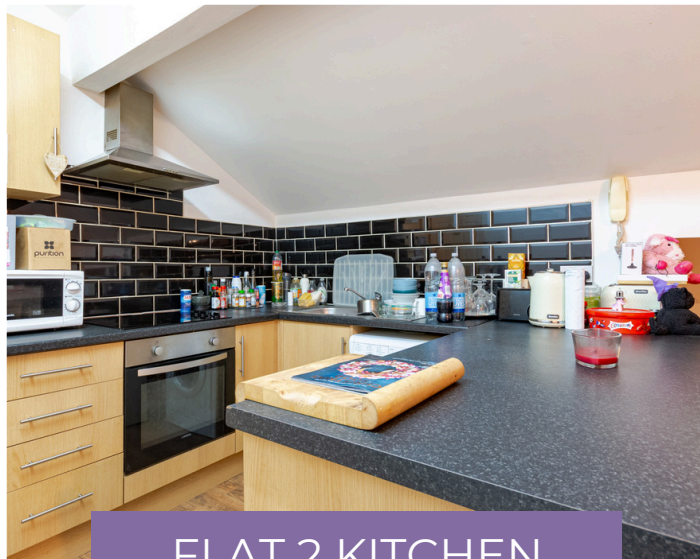
FLAT 2 KITCHEN