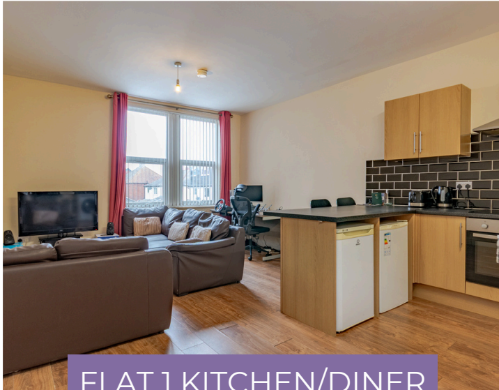
FLAT 1 KITCHEN/DINER