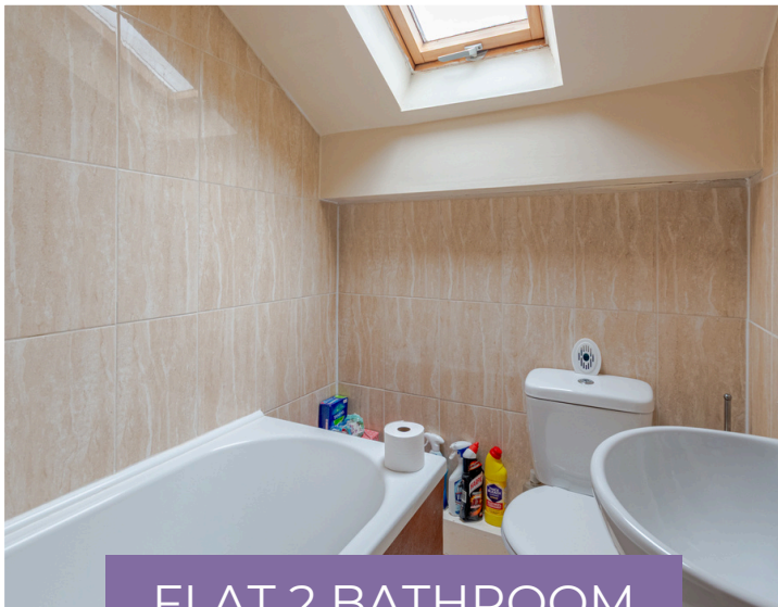
FLAT 2 BATHROOM