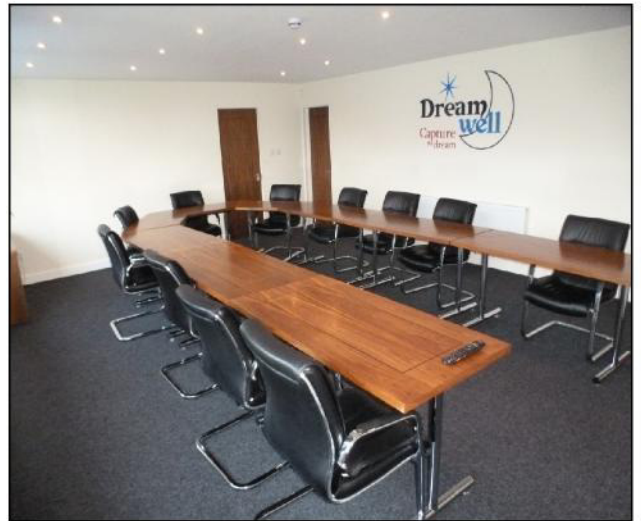
The spacious Board Room is available for tenants to hire out for meetings.